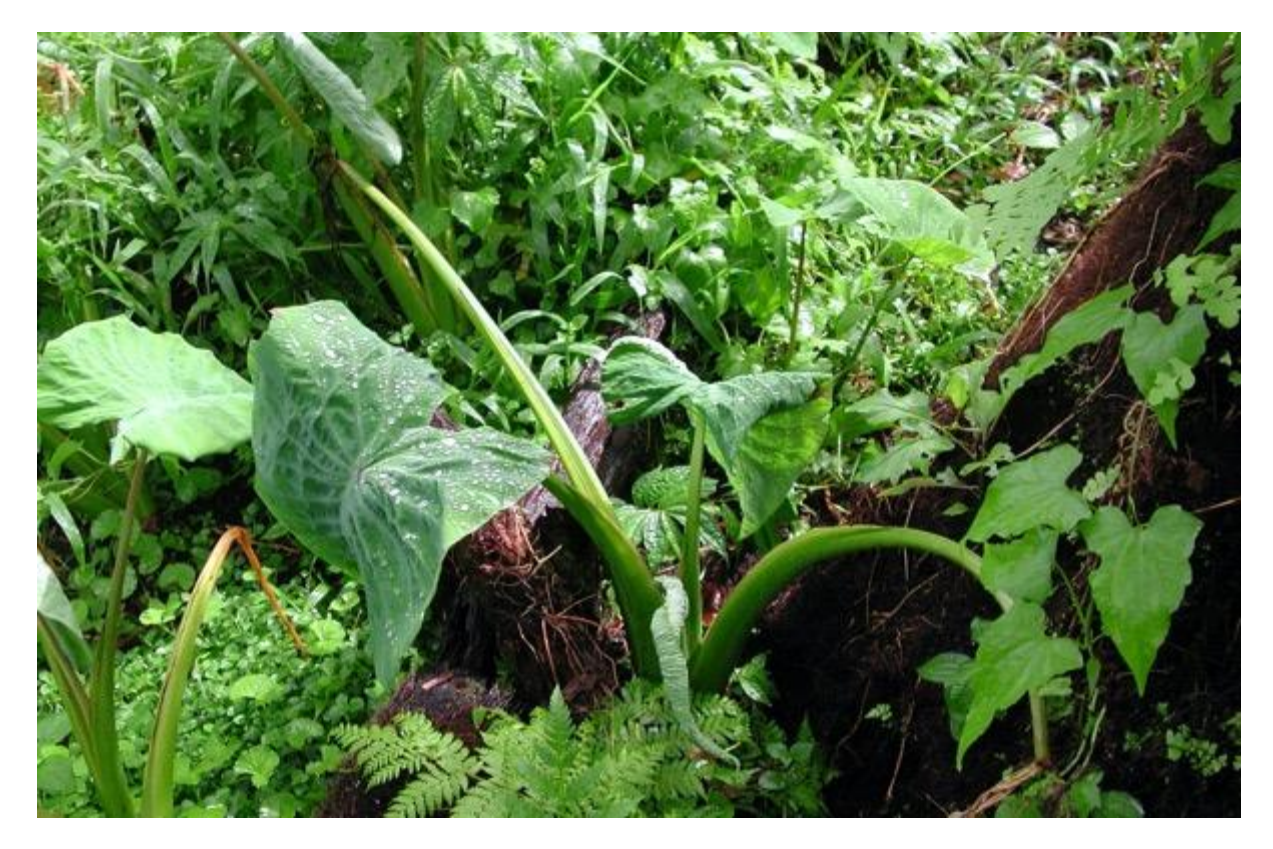
Fig. 1 Alomae . Leaves short, green, fleshy, crinkled, bent and downward pointing. The leaves of all but the youngest leaves are wilting. The youngest leaf is rolled and distorted, and will not open. The plant will stop growing, rot and die. Photo: Gwaiau, Malaita, Solomon Islands.