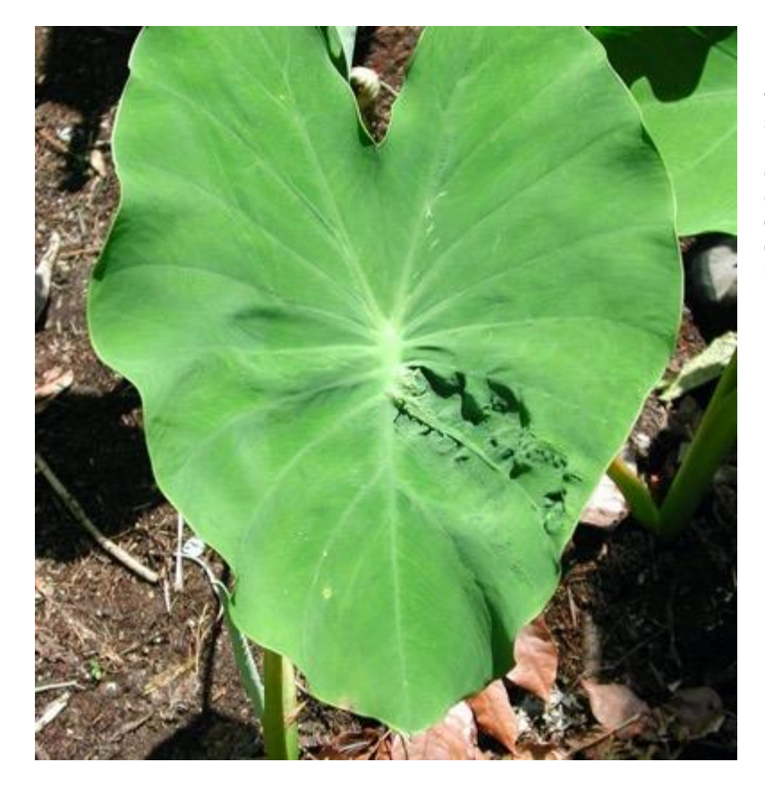
Fig. 7 Large particle symptom (LPS) on male taro. Later, test would show that Tarophagus spreads the large bacilliform virus (renamed CBDV) to female taro causing bobone , and to male taro causing a mild patch-like distortion (as in the photo). Two or three leaves show symptoms before full recovery occurs. Photo: Malaita, Solomon Islands.

We found male taro with thickened, distorted green patches on their leaves, often no more than 10 cm wide. Up to three leaves showed symptoms before apparently healthy leaves appeared. In these, Rothamsted found the large bacilliform particle. The symptoms on these plants was called LPS - large particle symptom.