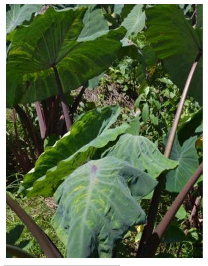
Fig. 20 Plant showing distinctive symptoms of TaVCV. Note the umbrella-shaped leaves typical of the infection by the strain in Vanuatu (see Fig. 14, left). The leaf at top left shows the feathered vein-yellowing at it appears from the underside of the leaf. Photos: west coast Upolo, Samoa.

In April 2017, Grahame was in Samoa for SPC, documenting the use of CePaCT germplasm and visiting the backup tissue culture collection at USP.