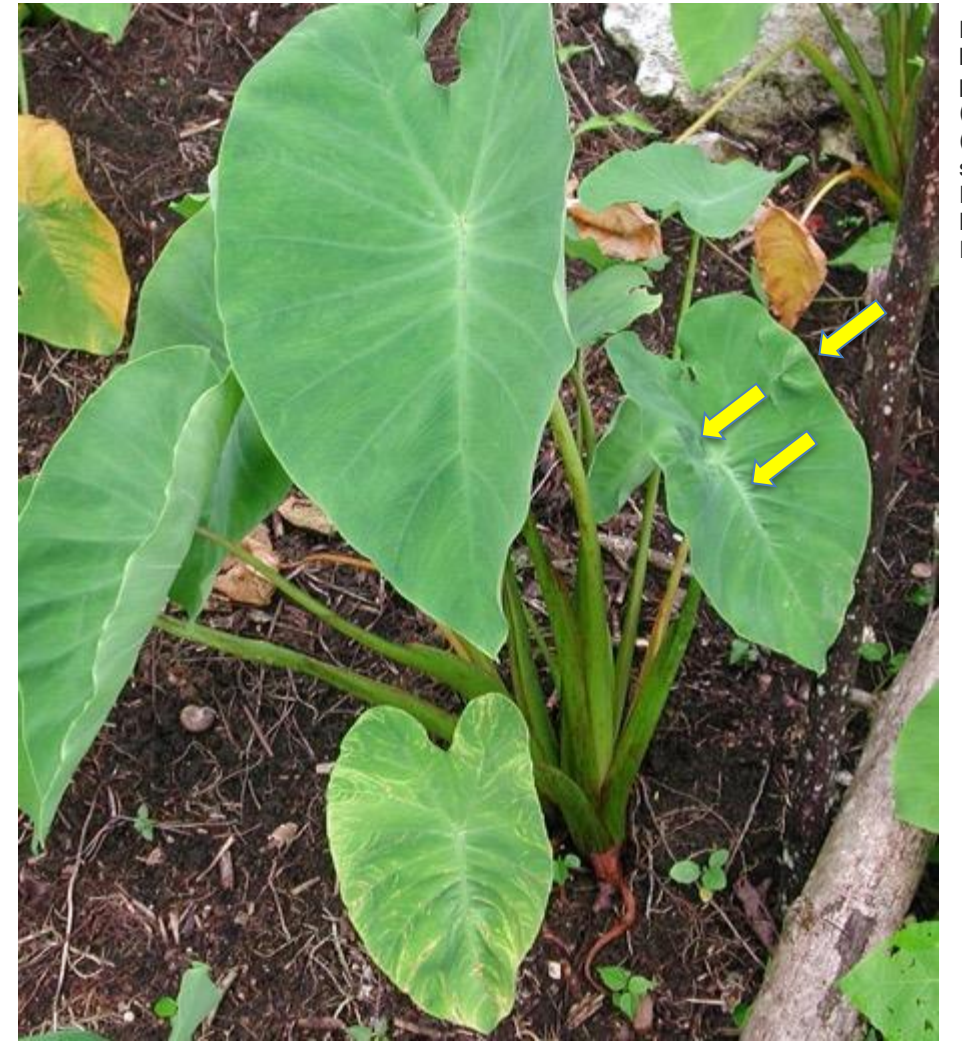
Fig. 19 Plant showing both LPS (CBDV) puckering symptom (arrows), and TaVCV (lower front), but without symptoms of alomae .