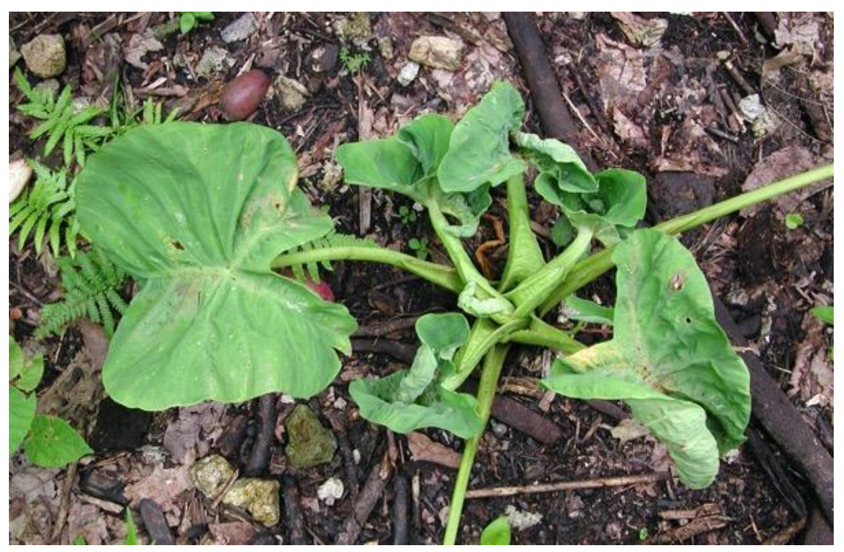
Fig. 4 Bobone . The first sign is a short leaf with stiff downward-pointing blade (left). Leaves remain green, but become extremely stunted, fleshy, and severely distorted. Galls may form on the leaf stalks. After five or more leaves with symptoms, plants begin to recover and, eventually, they appears healthy. Photo: Dala, Malaita, Solomon Islands.

In contrast to alomae , there is no kastom cure for bobone . It seems that female taro are not held in the same high esteem as male taro, perhaps because there are only a few of them, or they have appeared only relatively recently. But growers like them a lot, not only because they don't die, but bobone leaves are thick and tasty when cooked, and make an excellent cabbage! Whatever, the reason, the plants are not removed from plantings. They are just left to recover.