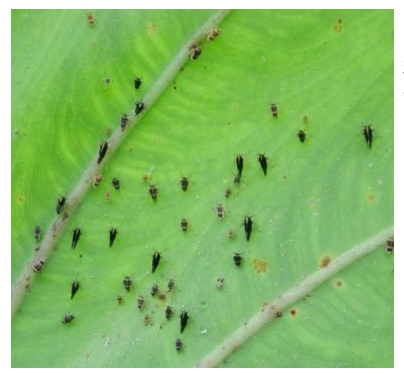
Fig. 10 Tarophagus sp. the vector of the large bacilliform virus of alomae and bobone (CBDV). Different life stages are shown; most of the adults have wings. Winged forms appear when populations are high allowing them to disperse to nearby gardens, or further on the wind. Photo: Malaita, Solomon Islands.

Roger Plumb, assisted by Andy Dabek, took over from Ray Kenten, transmission tests were set up at Dala to show that planthoppers and mealybugs were the vectors of the large and small bacilliform particles respectively, and together the cause of the two diseases. When symptoms developed sample plants went to Rothamsted for analysis. In those days it was examination by an electron microscope only.