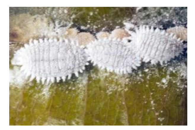
Fig. 11 Planococcus citri. This is similar to the mealybugs collected at Dala Research Station, identified first as P. citri , then P. pacificus , and finally as P. minor. Photo: Citrus mealybug ( Planococcus citri ). Jeffrey W. Lotz, Florida Department of Agriculture and Consumer Services, Bugwood.org.

Test plants were screened for 6 months before they were used in transmission tests to ensure they were free from obvious virus, insects were collected from gardens free from symptoms, or from wild taro in isolated swamps on the Guadalcanal Plains along the road to Gold Ridge in the foothills of the island's mountains, given acquisition feeds on plants with alomae or bobone (for >2 days) and then placed on the test plants<sup>27</sup>. They were left on the plants for varying times.