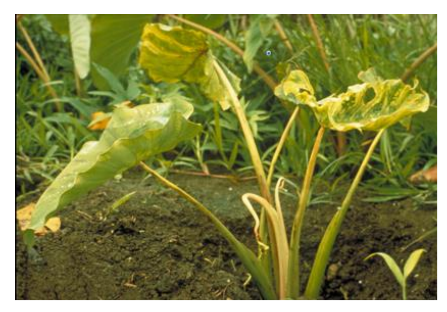
Fig. 15 S-DsMV. Severe-Dasheen Mosaic Virus in French Polynesia. There is severe distortion of the leaves, and symptoms of DsMV occurs on most of them in contrast to symptoms in other Pacific island countries. The other contrast with 'normal' DsMV is that the plants do not recover from the symptoms. It is seen most often on variety Mana Ura. Photo: Tahiti, French Polynesia.

The problem persisted and, in August 1982, Grahame visited French Polynesia for SPC<sup>58</sup>. Several thousand taro on Tahiti and Moorea were inspected. DsMV symptoms were common in the plantings, but there were no symptoms from infections by large or small bacilliform viruses. In a majority of plants, symptoms were similar to those reported in many countries where DsMV occurs: leaves showed pale, green-to-yellow "feathering" patterns along the main veins, but they were seldom distorted, or reduced in size. Mostly, symptoms were present on young plants and those close to harvest.