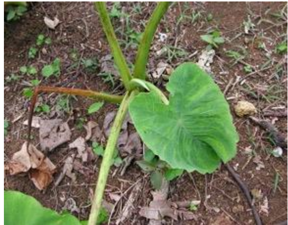
Fig. 18 Plants with alomae , but also showing symptoms of TaVCV. Left: plant from the same garden as Figs. 1&2. It is showing TaVCV on the two expanded leaves, and initial signs of alomae on the still rolled leaf. Above: TaVCV on the expanded leaf, which is also distorted; the rolled leaf is showing typical early alomae .