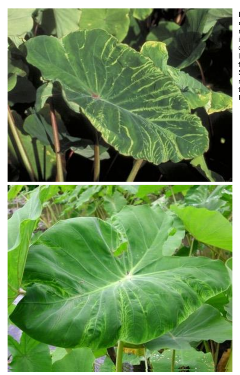
Fig. 12 TaVCV – Taro vein chlorosis virus. Another rhabdovirus found first in surveys in Vanuatu. Symptoms are most obvious at the margins of the leaves where the bright yellow feathering borders the veins. Sometimes leaves also show mild distortions, but nothing like those of alomae and bobone . Photo: Sarete, Santo, Vanuatu.