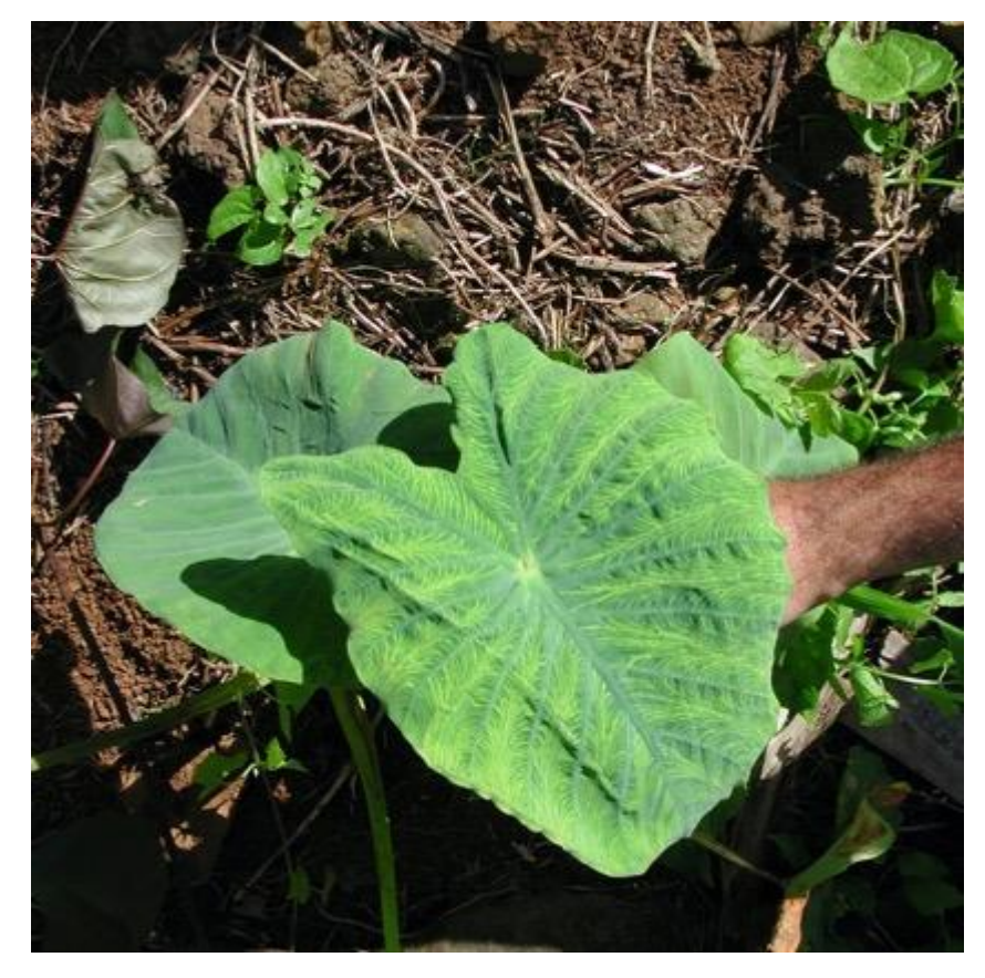
Fig. 17 TaBV – Taro badnavirus. In this leaf the feathering is very obvious, and similar to that which occurs with TaVCV infection. In this instance, the feathering is between the veins. Often, it is difficult to differentiate between the two infections on symptoms alone, especially when only part of the leaf it showing vein-yellowing. Photo: Safaatoa, Upolu, Samoa.

The study at Alafua confirmed that mealybugs transmitted TaBV. Mealybugs were collected from the field from symptomless plants (PSB-G2) and placed for 3 months on a PCR-tested, mealybug-free, PSB-G2 plant maintained in a screenhouse. The host plant remained symptomless and tests should that it was negative for TaBV at the beginning of the trial. Mealybug transmission was investigated by exposing 51 PCR-tested, 1-2-month-old symptomless PSB-G2 suckers to mealybugs reared on TaBV-infected plants. Typical virus symptoms developed on 17 plants between 24 and 36 days. These and 13 symptomless plants tested positive for TaBV by PCR.