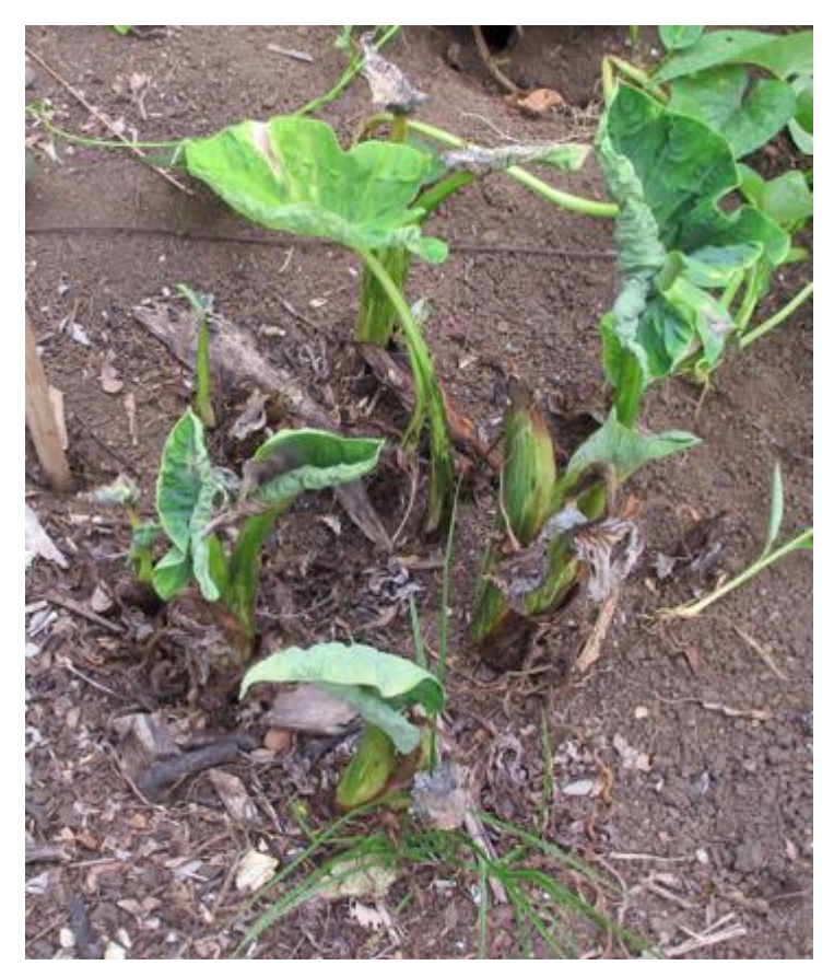
Fig. 3 Alomae. The disease has come late to this plant, when it was near maturity and had suckers. The main plant is without leaves and remains as a stump of rotting leaf stalks. Some suckers remain alive, and their leave are curled, crinkly and fleshy. These symptoms are typical of the way that plants with alomae die. (Photo: near the New Guinea Binatang Research Centre, Madang, Papua New Guinea, June 2015)