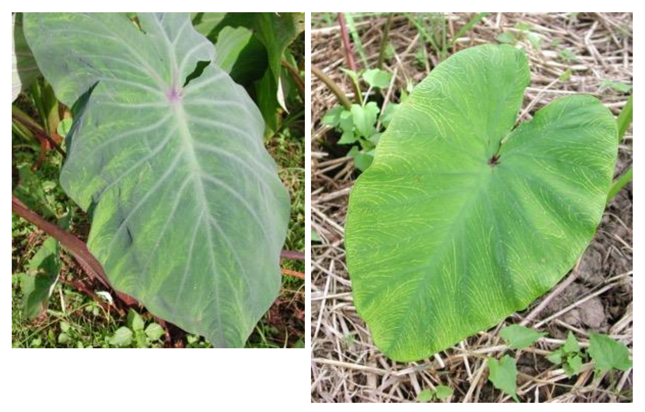
Fig. 14 TaVCV – Taro vein chlorosis virus Fiji. In general, the diseases in Fiji and Vanuatu are similar except that the yellowing of the veins is not as bright in leaves from Fiji compared to those from Vanuatu. Whether that is due to differences in the virus or the varieties between the two countries is not known. Photos: Varieties Vutokoto (left) and Naloaloa (right), Vanua Levu, Fiji.

The conclusion from differences in serological reaction, particle size and disease symptoms was that the vein-yellowing and bobone -associated viruses are not identical, although they are serologically related. Whether they should be called different species or different strains of the same virus was left undecided.