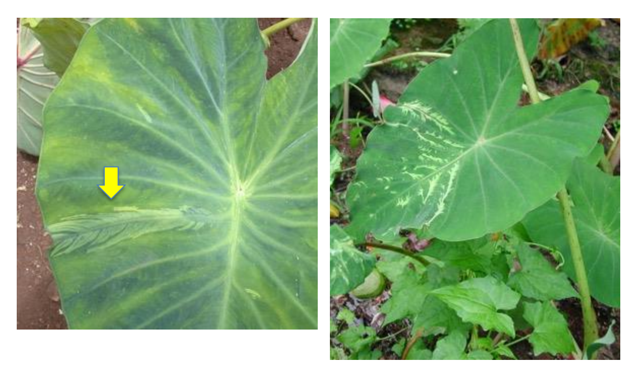
Fig. 5 Dasheen mosaic virus. Often the symptom is along the veins (left), with a greyish-green, feather-like appearance (arrow), or along and also between the veins (right), where, and in this case it is much brighter. The wilting and major distortion of the leaves as occurs with alomae and bobone is not seen with DsMV. Photo: Unia, Yate, New Caledonia (left); Sarete, Santo, Vanuatu (right).

The description of the acute form is reminiscent of alomae with, perhaps, the chronic form describing DsMV.