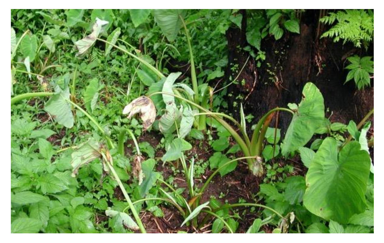
Fig. 2 Alomae. A second common symptom. The leaves have wilted, but they are not fleshy and dark green, (as in Fig. 1), and the youngest leaf is rolled but not distorted. These leaves will not open further; they will rot and the plant will die. Photo: Gwaiau, Malaita, Solomon Islands, same garden as Fig. 1.

Fig. 1 Alomae . Leaves short, green, fleshy, crinkled, bent and downward pointing. The leaves of all but the youngest leaves are wilting. The youngest leaf is rolled and distorted, and will not open. The plant will stop growing, rot and die. Photo: Gwaiau, Malaita, Solomon Islands.