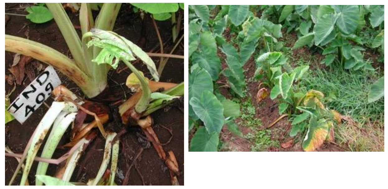
Fig. 16 Severe infections with similarities to alomae and bobone . Left: TANSAO accession (IND409) growing in Vanuatu; right: Variety Bourbon, New Caledonia. Both have symptoms of TaVCV infection. Photos: Saratou, Santo, Vanuatu (left); Ponerihouen, New Caledonia (right).

Rarely, but occasionally severe symptoms associated with TaVCV were seen in both New Caledonia and Vanuatu. For example, variety IND 409 an accession from the TANSAO collection from Indonesia, and the cultivar Bourbon from New Caledonia, a triploid taro. These two symptoms were not investigated, unfortunately.